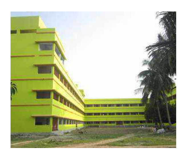
1) PARIVAAR Construction of a multi-activity hall at a Residential School for impoverished children, in collaboration with PARIVAAR