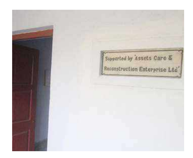
2) AIMA Basic IT Skills training program for under-privileged children, in collaboration with AIMA